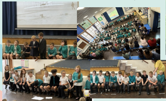
We all really enjoyed the Year 2 class assembly.