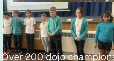
Over 200 dojo champions