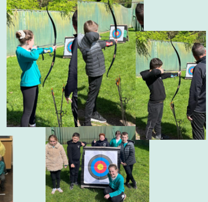
Some of our children represented the school at a local archery session.