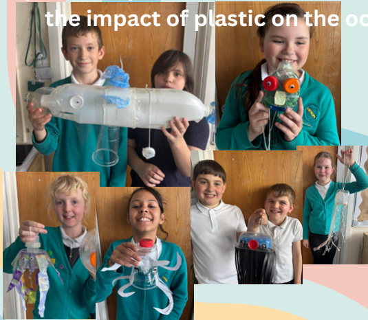
Year 5 have been creating unique art pieces as part of their work on exploring the impact of plastic on the oceans.