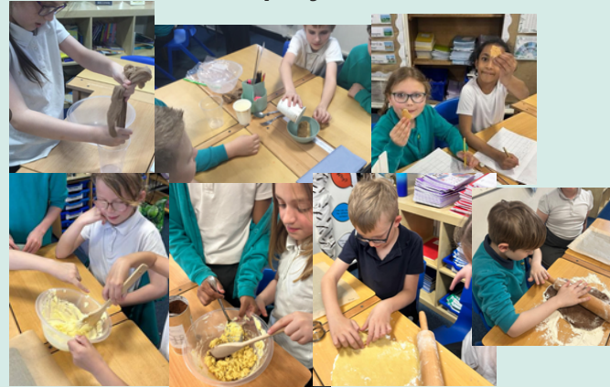
Year 4 have been baking as part of their DT project.