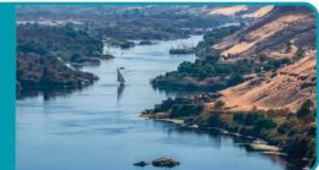
Longest river in the world: The River Nile, Africa.