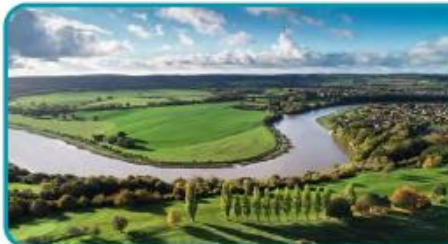
Longest river in the UK: The River Severn.