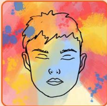
Wash of paint

Match the materials you choose to the effect you want to create