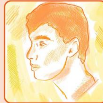
Relaxed and happy